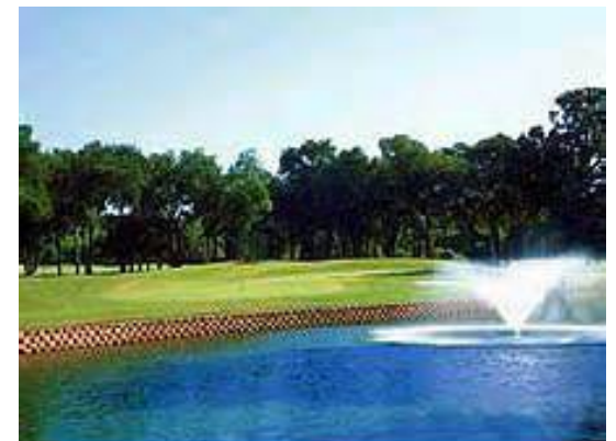
Pecan Valley River Course

The "River" Course considered one of the top municipal courses in Texas, plays to about 6,100 yards from the Regular (White) Tees and can be extended to 6,600 yards from the Championship (Blue) Tees. A driving range is located across the river approximately 200 yards from the Club House. It has several target greens and a practice sand trap.